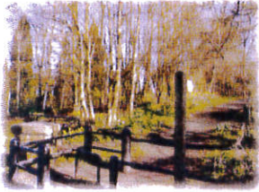
Bridleway off Eastern Way

Pass the Stars pub and the Safeway supermarket and at the bus stop is a footpath sign. Turn left here into The Park and pause on the plank bridge over the Pont. There was a railway bridge at this place and by looking up and down the footpath the old embankment can be made out which carried the railway tracks. We are next to the Memorial Hall car park at this point. Turn right after crossing the bridge and walk alongside the river Pont and under a road bridge.