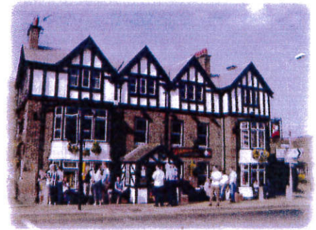
The popular Diamond Inn

START on the bridge over the river Pont on the A696 from Newcastle to Scotland.