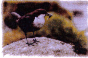
Dipper about to feed young

There are many of the common birds as well as the kingfisher, tree creeper, nuthatch and jay all of which have been seen in the woods here.