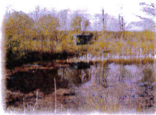
The Hide next to the Ox-bow pond

A pair of dippers nested in the river bank in 2003 and successfully hatched another brood in 2004. The ox-bow pond has a hide with easy access from Fox Covert Lane.