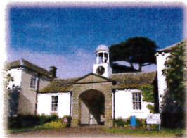
Arch into courtyard at Kirkley Hall

planted here. Turn towards the clock tower and look through the arch to find a magnificent 300 year old Cedar of Lebanon! It is said that a house was built on this site in 1764 around the Cedar tree which was then reported to be about a hundred years old. Go to the L in front of the clock tower and there is a FP sign for a path which contours around the front of Kirkley Hall. Take time to have a look in the Hall gardens R and down to a pond L before crossing the ladder stile. The trees and gardens are well worth a closer look and many of the plants are labelled to satisfy the curious.