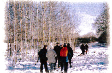
The Bridleway next to the golf course

NB This walk crosses the Pont by stepping stones; an interesting challenge to some or a complete turn-off for others.