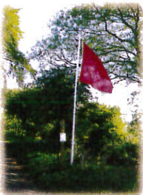
Red flag indicates firing on the range

The track continues, sometimes through mud, sometimes on a hard surface, until it reaches the Berwick Hill road. Turn L on road and walk on R-hand verge facing the oncoming traffic past East Farm on the R into Berwick Hill. At the next houses on R there is a BVV signed for Berwick Hill Low House. Follow this grassy track with hawthorns on either side at first until it goes through a wicket onto a cultivated field. TL along the field edge and at the next field boundary TR and walk down the field with the hedge on your R to Berwick Hill Low House. Follow this grassy track with hawthorns on either side at first until it goes through a wicket onto a cultivated field. TL along the field edge and at the next field boundary TR and walk down the field with the hedge on your R to Berwick Hill Low House. Cross the stile and follow arrows to drop down to the Pont. There are well spaced stepping stones to cross the river and then TL and up to the next farm, South Carter Moor.