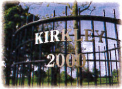
Millennium Oak Tree

The track bears left and then through a gate. There are various brick-built farm buildings on the R and then sheds and hemmels and the estate road reaches a small roundabout. There is a Millennium Oak