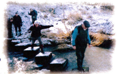
Stepping Stones over the Pont

If for any reason, flood, ice or infirmity, the stepping stones cannot be negotiated, it is possible to TL at Berwick Hill Low House onto the road then R past Cornyhaugh farm and use the track R at Kirkley Mill to rejoin the route at South Carter Moor. The river Pont joins the Blyth just downstream from the stepping stones and flows into the sea at the Port of Blyth.