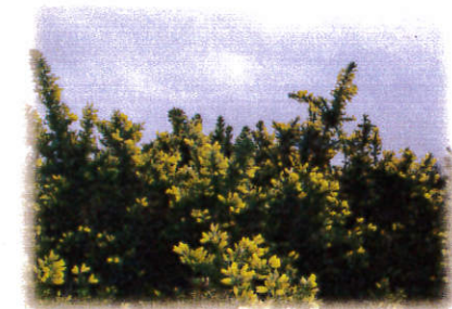
Gorse in Spring

The Rifle Range was built in 1902 on land bought from Lord Ridley. There were three gallery ranges which were converted into electronic targets in 1985. Now part of the Army Training Establishment, two of the ranges are still used by Cadets and Reserve Forces.