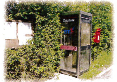
Start of the walk in Medburn

BVW = bridle way SO = straight on FB = foot bridge FP = foot path TR = turn right TL = turn left SP = sign post