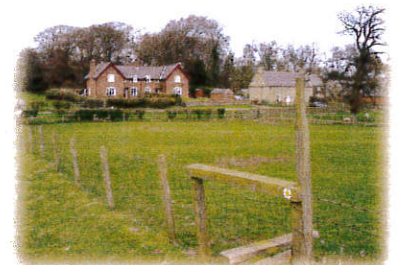
Stile and path to High House

The former Dalton Mill is L. Follow the arrows and directions till the road is reached through a kissing gate. TR and along the road and look for a SP on the right pointing to a FP on the left to Silverhill which goes between Hawthorne Cottage and The Old School. A stile gives onto a path beside tall conifers and continues SO into the fields. Bear slightly R in the second field to the corner stile and then with the hedge on R make towards the red-brick house, Silverhill. Cross the road and pick up the FP for Milbourne. This goes alongside a large cultivated field to a ladder stile and then slightly uphill towards the top of a tree seen on the horizon. Go through a red metal gate on the right. There is a wide grassy verge on the next field and the arrows should be followed to come out on the road at High House.