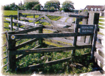
Direction arrow near Dissington Old Hall

START opposite the telephone kiosk in Medburn and take the track signed for South Dissington and Eachwick Moor. Walk over a cattle grid and in front of the next one take the L hand metal gate. Dissington Old Hall is on the R and in the small field in front are some stone remains. A pseudo-Roman torso and altar are dated C17.