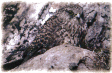
A well camouflaged kestrel

TR on road and immediately L alongside a house into the grounds behind. These are the grounds of Milbourne Hall. Go through the gate and follow the track until the large octagonal stable block is reached and come off the track L, past the abandoned pig sties and through the undergrowth to a ladder stile in the fence. Milbourne Hall was built with beautiful golden sandstone from the Belsay quarries for Ralph Bates in 1807. From the ladder stile bear R across the pasture for the next stile and follow arrows to a plank bridge at the next field boundary. Milbourne Church is seen on the right and the path crosses the field behind it and exits onto the road. There is a gate in the wall of the church yard for those who wish to have a look round.