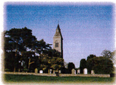
The Steeple of Milbourne Church rises above the trees

TR on road and immediately L alongside a house into the grounds behind. These are the grounds of Milbourne Hall. Go through the gate and follow the track until the large octagonal stable block is reached and come off the track L, past the abandoned pig sties and through the undergrowth to a ladder stile in the fence. Milbourne Hall was built with beautiful golden sandstone from the Belsay quarries for Ralph Bates in 1807. From the ladder stile bear R across the pasture for the next stile and follow arrows to a plank bridge at the next field boundary. Milbourne Church is seen on the right and the path crosses the field behind it and exits onto the road. There is a gate in the wall of the church yard for those who wish to have a look round.