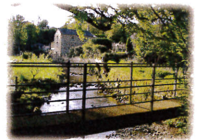
Footbridge at Dalton Mill

The former Dalton Mill is L. Follow the arrows and directions till the road is reached through a kissing gate. TR and along the road and look for a SP on the right pointing to a FP on the left to Silverhill which goes between Hawthorne Cottage and The Old School. A stile gives onto a path beside tall conifers and continues SO into the fields. Bear slightly R in the second field to the corner stile and then with the hedge on R make towards the red-brick house, Silverhill. Cross the road and pick up the FP for Milbourne. This goes alongside a large cultivated field to a ladder stile and then slightly uphill towards the top of a tree seen on the horizon. Go through a red metal gate on the right. There is a wide grassy verge on the next field and the arrows should be followed to come out on the road at High House.